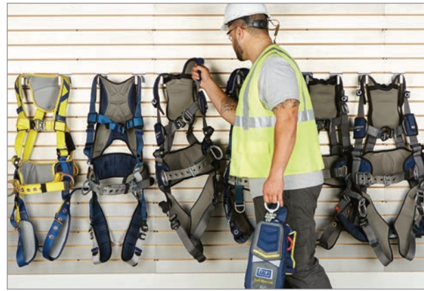
Fits on to almost any safety harness.

Free yourself to use your own safety harness.