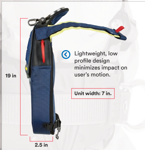
Lightweight, low profile design minimizes impact on user's motion.