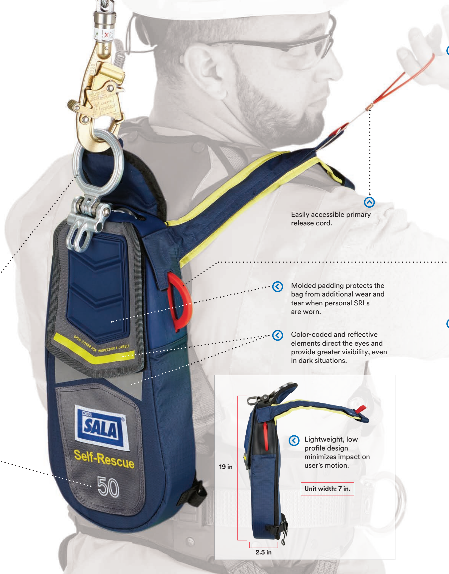
Easily accessible primary release cord.

Every at-height work site is different, so it only makes sense that your safety equipment fits the job you set out to do. With both 50- and 100-foot models to choose from, the Self-Rescue Device gives you more flexibility and convenience whatever your work site application needs may be.